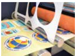
waste matrix removal